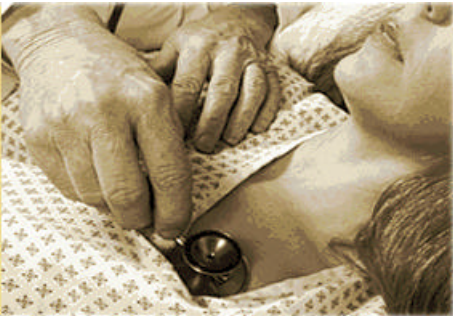
Nearly half of physicians punished for sexual offenses continue to practice.

40% of physicians punished for sex offenses continue to practice medicine.